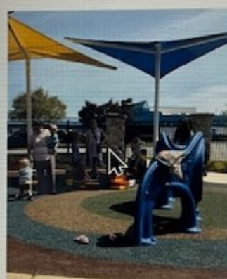
Top left: The Sensory Garden opened in April at the High Point Public Library.

The library held a ribbon-cutting for the self-contained, 7,000-square-foot sensory garden in April.